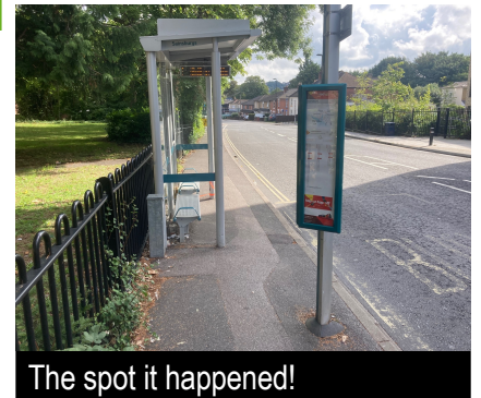
The spot it happened!